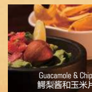
Guacamole & Chips 鳄梨酱和玉米片