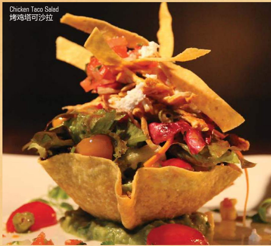
Chicken Taco Salad 烤鸡塔可沙拉