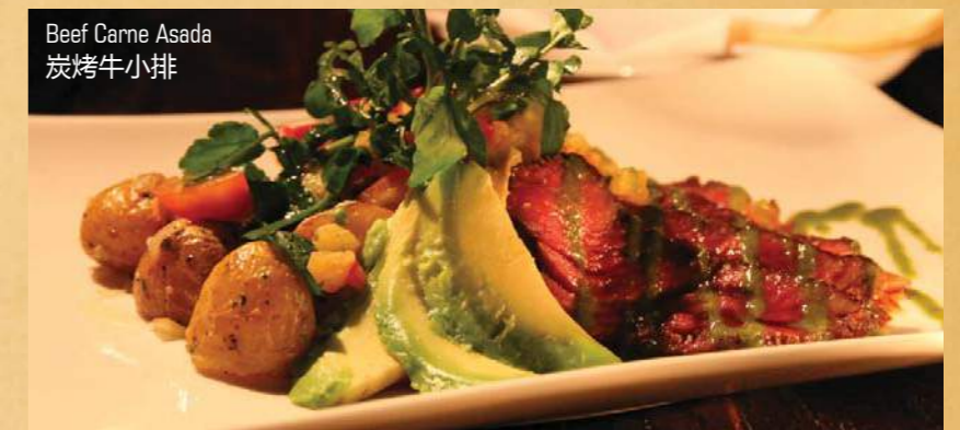
Beef Carne Asada 炭烤牛小排