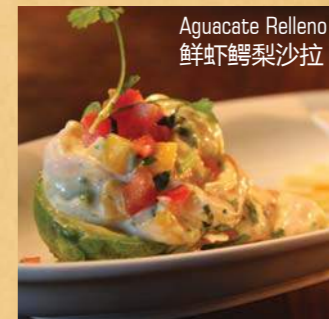
Aguacate Relleno 鲜虾鳄梨沙拉