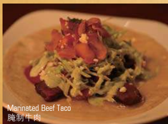
Marinated Beef Taco 腌制牛肉