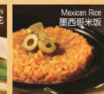
Mexican Rice 墨西哥米饭