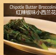
Chipotle Butter Broccolini 红辣椒味小西兰花