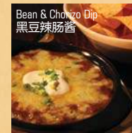
Bean & Chorizo Dip 黑豆辣肠酱