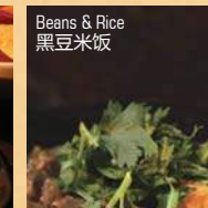
Beans & Rice 黑豆米饭