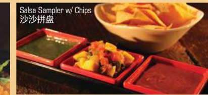
Salsa Sampler w/ Chips 沙沙拼盘