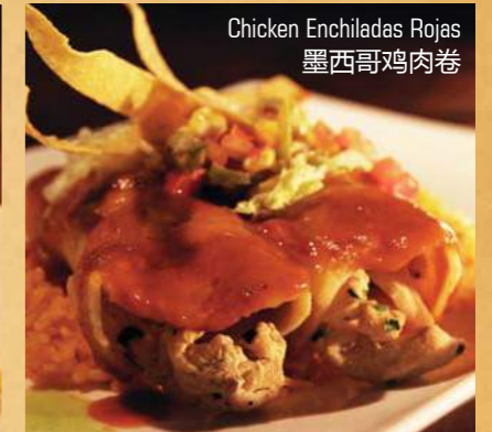
Chicken Enchiladas Rojas 墨西哥鸡肉卷