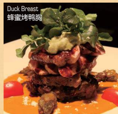
Duck Breast 蜂蜜烤鸭胸