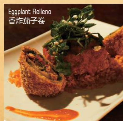
Eggplant Relleno 香炸茄子卷