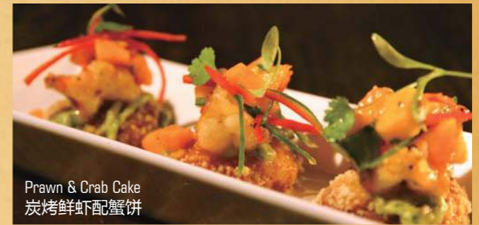
Prawn & Crab Cake 炭烤鲜虾配蟹饼