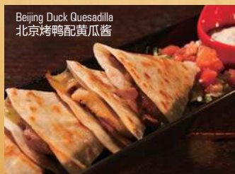
Beijing Duck Quesadilla 北京烤鸭配黄瓜酱