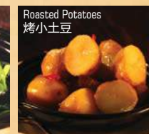
Roasted Potatoes 烤小土豆