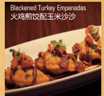
Blackened Turkey Empanadas 火鸡煎饺配玉米沙沙