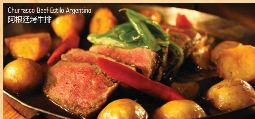
Churrasco Beef Estilo Argentino 阿根廷烤牛排