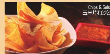
Chips & Salsa 玉米片和沙沙