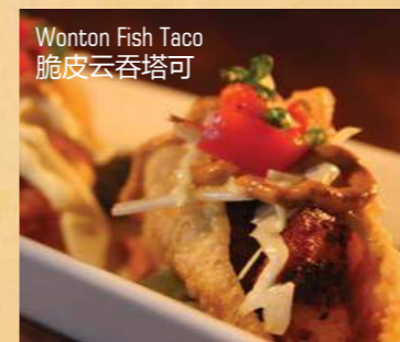
Wonton Fish Taco 脆皮云吞塔可