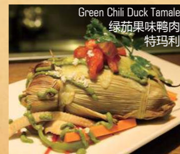
Green Chili Duck Tamale 绿茄果味鸭肉 特玛利