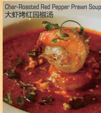
Char-Roasted Red Pepper Prawn Soup 大虾烤红园椒汤