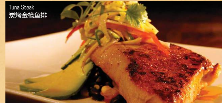
Tuna Steak 炭烤金枪鱼排