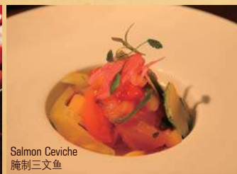
Salmon Ceviche 腌制三文鱼

Please let us know if you have a food allergy and we will help you to order your food - 请告知您的食物禁忌, 我们将对菜单做出相应调整