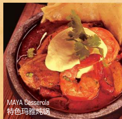
MAYA Casserola 特色玛雅炖锅