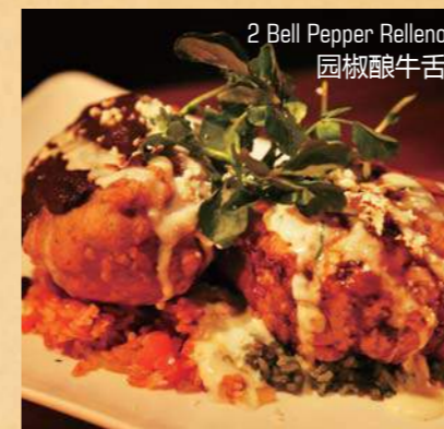
2 Bell Pepper Relleno 园椒酿牛舌