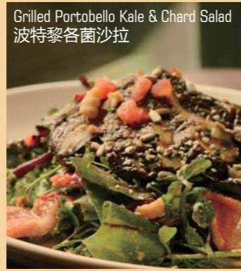
Grilled Portobello Kale & Chard Salad 波特黎各菌沙拉