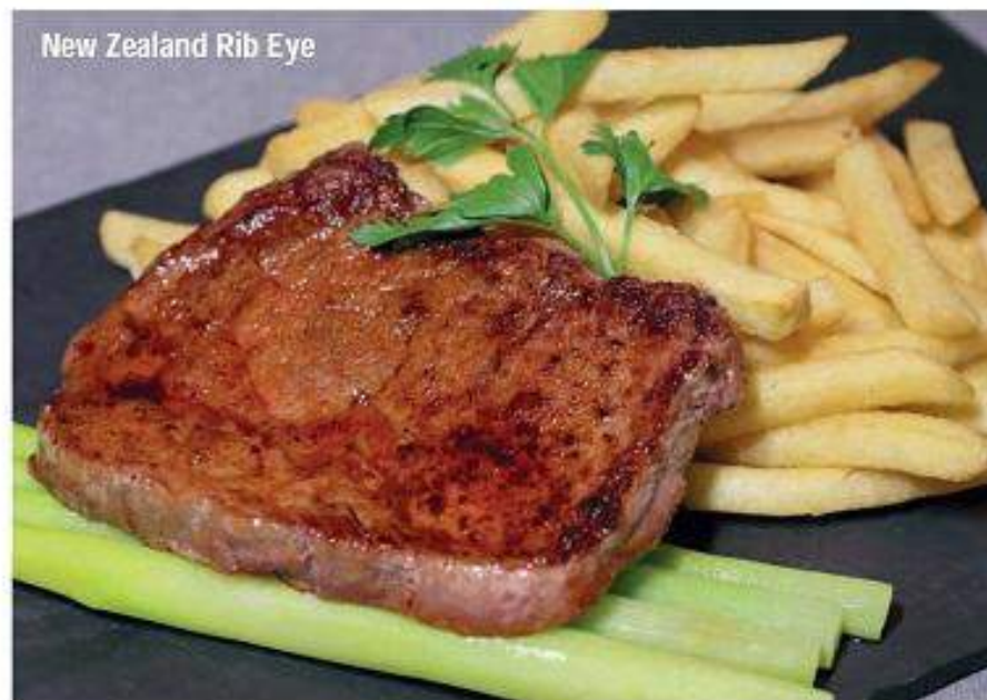
New Zealand Rib Eye