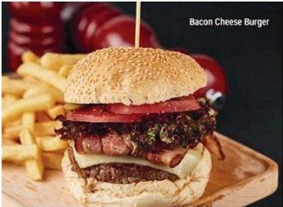
Bacon Cheese Burger