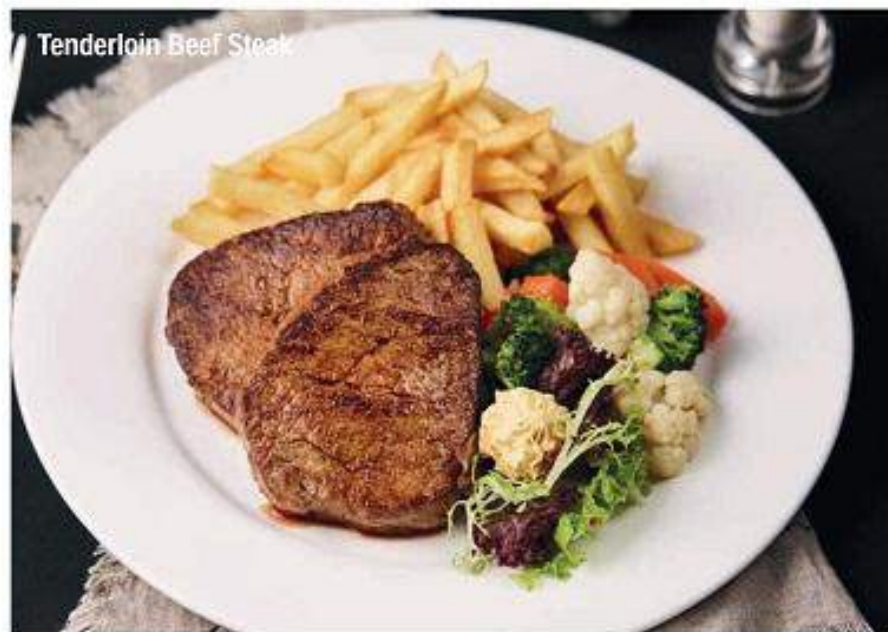
Tenderloin Beef Steak