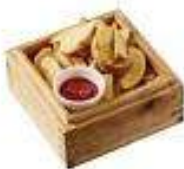
Potato Wedges 炸薯角