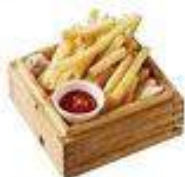
French Fries 炸薯条