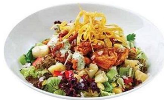
启博特利鸡肉色拉 79 Chipotle Chicken Chopped Salad

香烤多汁的鸡胸肉, 车达芝士、牛油果、番茄、煮鸡蛋、培根、洋葱和莴生菜, 佐以千岛酱。 hearty portions of grilled chicken breast, cheddar cheese, avocado, tomato, hardboiled egg, bacon, and onion - all chopped and served on a bed of crisp lettuce with 1000 island dressing. (400g)