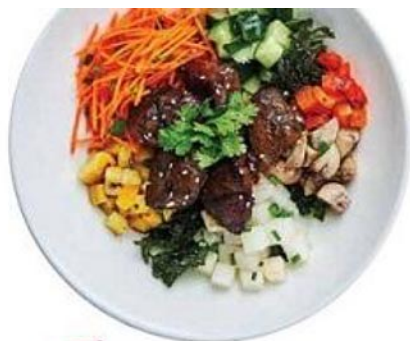
NEW 果木香烤牛肉色拉 89 Grilled Beef Steak Salad

地中海风味香料烤制的鸡胸肉，配上菲达芝士、双色橄榄果、拉法饼，以及生菜、番茄、黄瓜、洋葱等丰富的新鲜组合色拉，并佐以薄荷碎及折元素著名的米糟酸奶酱。 grilled Mediterranean styled chicken breast and feta cheese over mixed lettuce and laffa bread, chopped tomatoes and cucumbers dressed with lemon juice and olive oil, with onion, sliced black & green olives and chopped mints. served with miso-yogurt dressing. (460g)