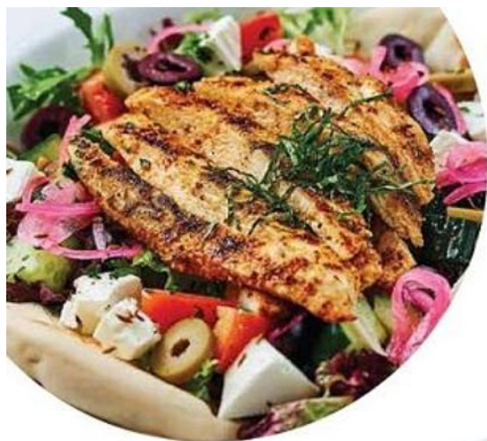
NEW 地中海风味拉法 烤鸡胸色拉 89 Laffa Bread Chicken Salad

地中海风味香料烤制的鸡胸肉，配上菲达芝士、双色橄榄果、拉法饼，以及生菜、番茄、黄瓜、洋葱等丰富的新鲜组合色拉，并佐以薄荷碎及折元素著名的米糟酸奶酱。 grilled Mediterranean styled chicken breast and feta cheese over mixed lettuce and laffa bread, chopped tomatoes and cucumbers dressed with lemon juice and olive oil, with onion, sliced black & green olives and chopped mints. served with miso-yogurt dressing. (460g)