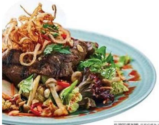
泰式牛排色拉 95 Thai Inspired Steak Salad

进口鲜嫩多汁的菲力牛排，配上用烤菠萝、烤花菜、胡萝卜和萝卜、西芹叶、蟹味菇混合的色拉，并佐以花生、香脆洋葱和泰式的拉差酱香醋汁。 imported beef filet, grilled pineapple, roasted cauliflower, carrot and radish, celery leaves, baby mushroom, peanuts, fried onion, and red chili tossed in spicy sriracha - soya dressing. (350g)