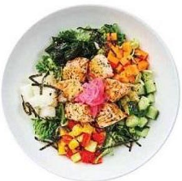
NEW LINNA 李娜 香烤剑鱼极色色拉 95 Grilled Swordfish Salad

一款时尚的夏威夷风味色拉，选用罗罗草腌制的三文鱼柳，配上杂粮寿司饭及用羽衣甘蓝、苦叶菜、黄瓜、凤水梨、裙带菜、烤红椒和海苔制成的色拉，并在以香浓的ABC甜酱。 our version of the classic Hawaiian salad - pieces of dill marinated salmon, sushi rice, with Asian pear, kale, frisee, cucumber, wakame, grilled pepper, drizzled with ABC sauce. (450g)