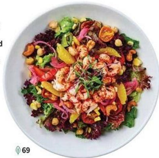
庄园烤蔬菜色拉 69 The Garden Grilled Salad

精选品质小龙虾纯虾肉, 配上进口的牛油果、混合嫩芽菜, 三角豆、生菜、羽衣甘蓝、烤樱桃番茄、酸洋葱、香橙肉和腰果, 并佐以法国芥末香醋汁。 freshly selected fresh crayfish meat, avocado, mirco greens, chick peas, kale, grilled cherry tomatoes, cashew nuts, orange wedges, onions, on bed of crisp lettuce. served with Dijon vinaigrette. (300g)