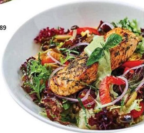
NEW 夏威夷风味 三文鱼波奇色拉 89 Hawaii Salmon Poke Salad

用罗罗草烤制的三文鱼柳，配上蟹味菇、烤红甜椒、玉米、生菜、红黄樱桃番茄、卡拉马特橄榄，佐味的面包丁，罗勒香叶和红酒香醋汁及绿色女神酱。 imported salmon marinated with dill, tender greens, baby mushroom, grilled peppers, corn, lettuce, yellow and red cherry tomatoes, fresh basil, marinated bread and kalamata olives - tossed with red wine vinaigrette and topped with green goddess aioli. (350g)