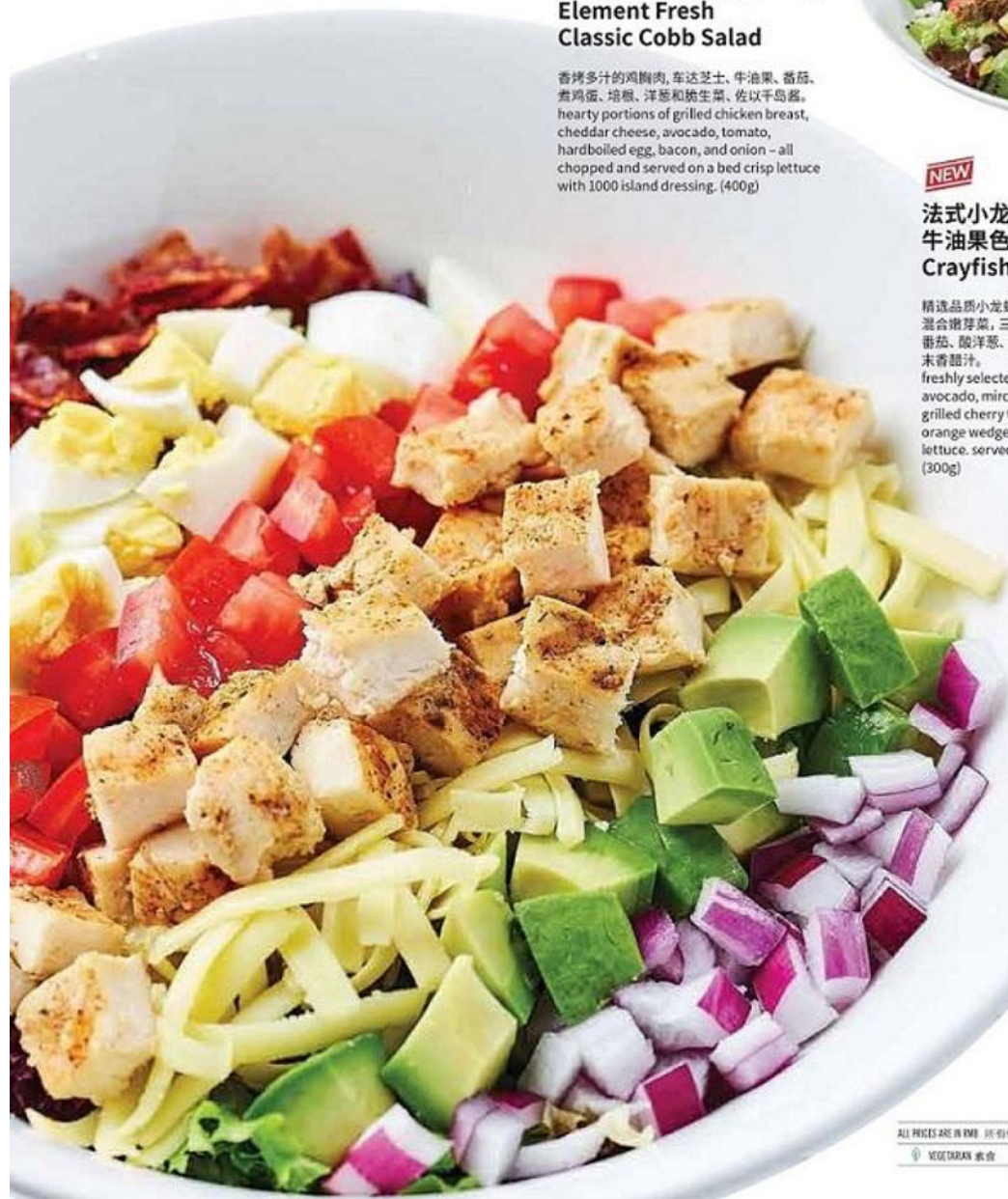
新元素经典考伯色拉 95 Element Fresh Classic Cobb Salad

香烤多汁的鸡胸肉, 车达芝士、牛油果、番茄、煮鸡蛋、培根、洋葱和莴生菜, 佐以千岛酱。 hearty portions of grilled chicken breast, cheddar cheese, avocado, tomato, hardboiled egg, bacon, and onion - all chopped and served on a bed of crisp lettuce with 1000 island dressing. (400g)